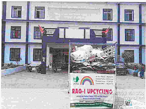
Apr 13, 2023 15:18:36 Wandhari Nagpur Division Maharashtra