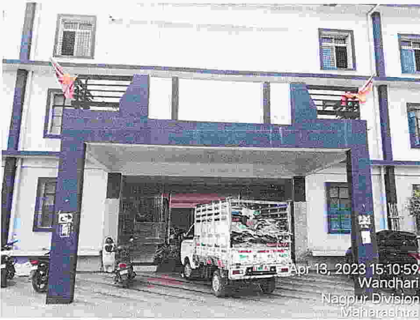
Apr 13, 2023 15:10:59 Wandhari Nagpur Division Maharashtra