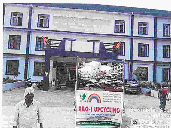
Apr 13, 2023 15:18:30 Wandhari Nagpur Division Maharashtra