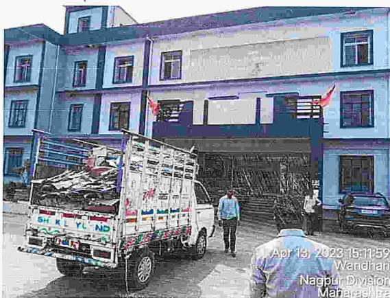
Apr 13, 2023 15:17:59 Wandhari Nagpur Division Maharashtra