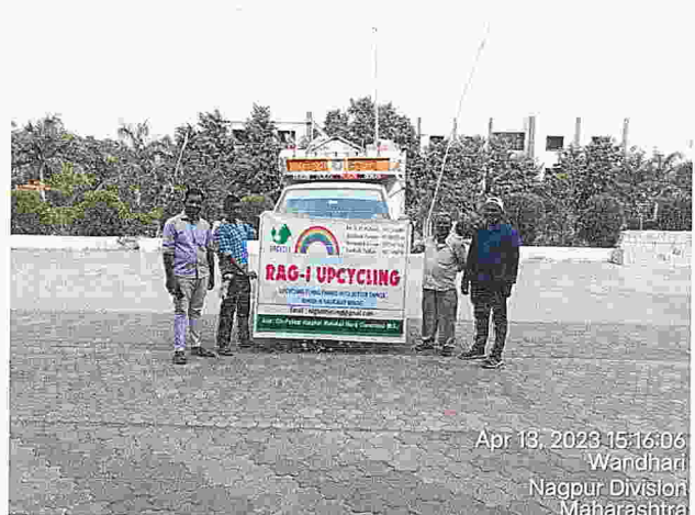
Apr 13, 2023 15:16:06 Wandhari Nagpur Division Maharashtra