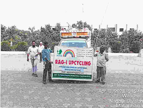
Apr 13, 2023 15:15:45 Wandhari Nagpur Division Maharashtra